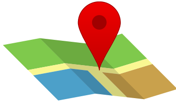
Proof of Address