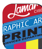
T.B.D. Publication Specialist T.B.D.@LCISD.org x0347