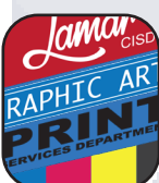
T.B.D. Print Production Technician T.B.D.@LCISD.org xXXXX